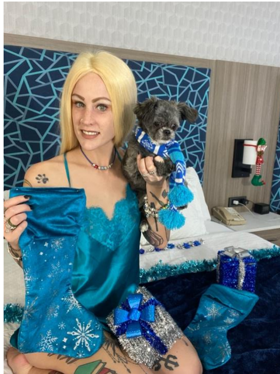
10. “Gothrider Gasoline Coffee,” TikTok Campaign, Hoski Media, March, 2022.