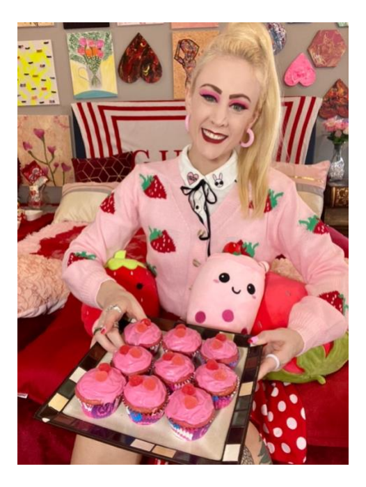
11. "Strawberry Shortcake" Kathleen Sumpton Photography, Stylecruze Magazine, vol. 393, March 14, 2023.

10. "Strawberries and Cream" Kathleen Sumpton Photography, Proficient Magazine, vol. 105, February 24, 2023.