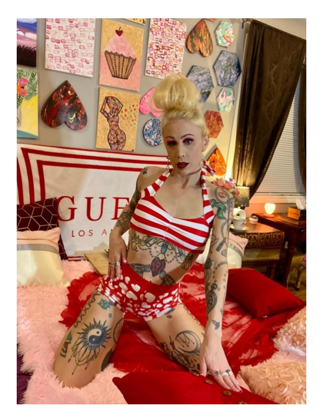
13. "St. Patrick's Day 2023" Kathleen Sumpton Photography, Babe Watch the Magazine, Inked vol. 70, March 24, 2023.